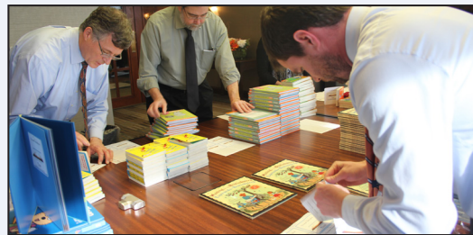
Sands Anderson’s 2016 holiday book drive donated more than 1,800 books to literacy outreach organizations.